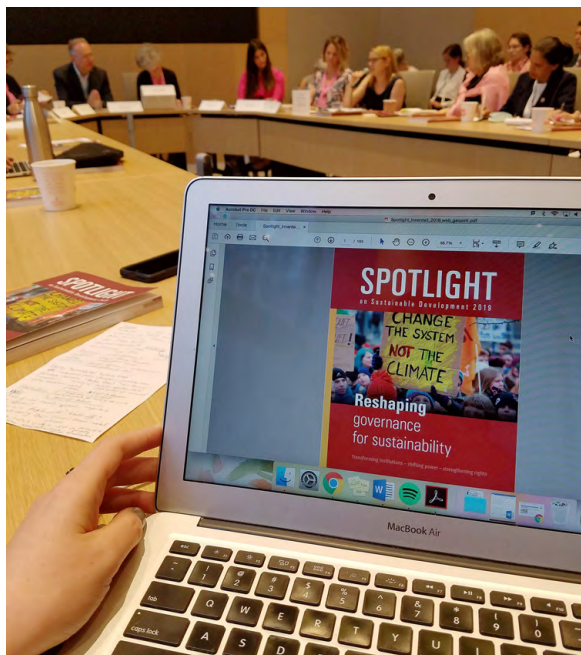
Launch of the 2019 Spotlight on Sustainable Development Report

GPF regularly takes the floor at UN events and other meetings to stress the link between civil society’s immediate concerns and UN processes beyond the 2030 Agenda. These include the lead-up to the UN’s 75 th Anniversary, preparations for the 2020 review of the High-Level Political Forum (HLPF), and the repositioning of the UN Development System.