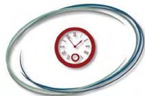
Global Policy Watch

Global Policy Watch, the main project of GPF, convened with the Instituto del Tercer Mundo (Social Watch), was developed to promote accountability and to engage Civil Society Organizations working on the full range of issues of the 2030 Agenda for Sustainable Development. Social Watch's network of local, national, and regional CSOs enables GPW to reach a wide audience with its analysis and to support CSO activities.