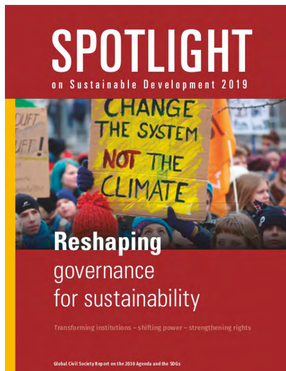
Spotlight on Sustainable Development – Report 2019